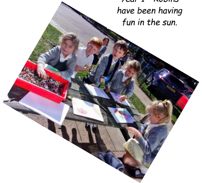
Year 1 - Robins have been having fun in the sun.