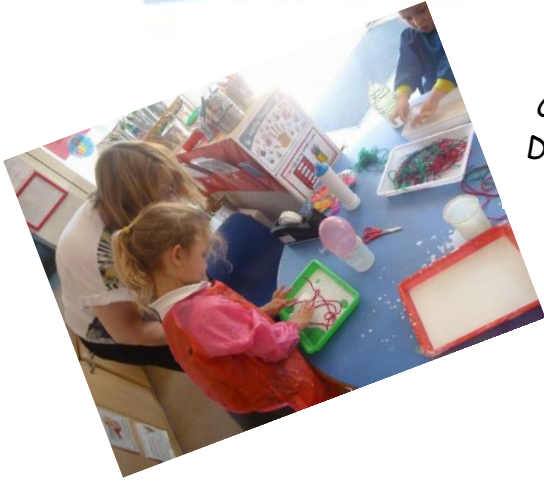
Easter Craft in Ducklings