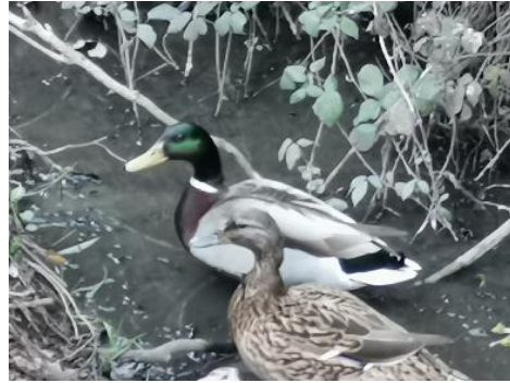
The ducks are back!