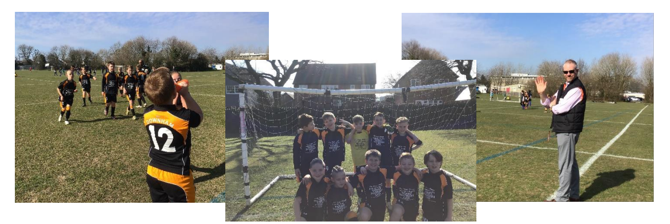
The Years 3 & 4 Football Team came 2<sup>nd</sup> at their tournament this week!